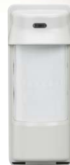
Outdoor Motion Detector