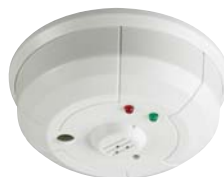
Carbon Monoxide Detector