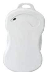
Remote Control/Life Safety